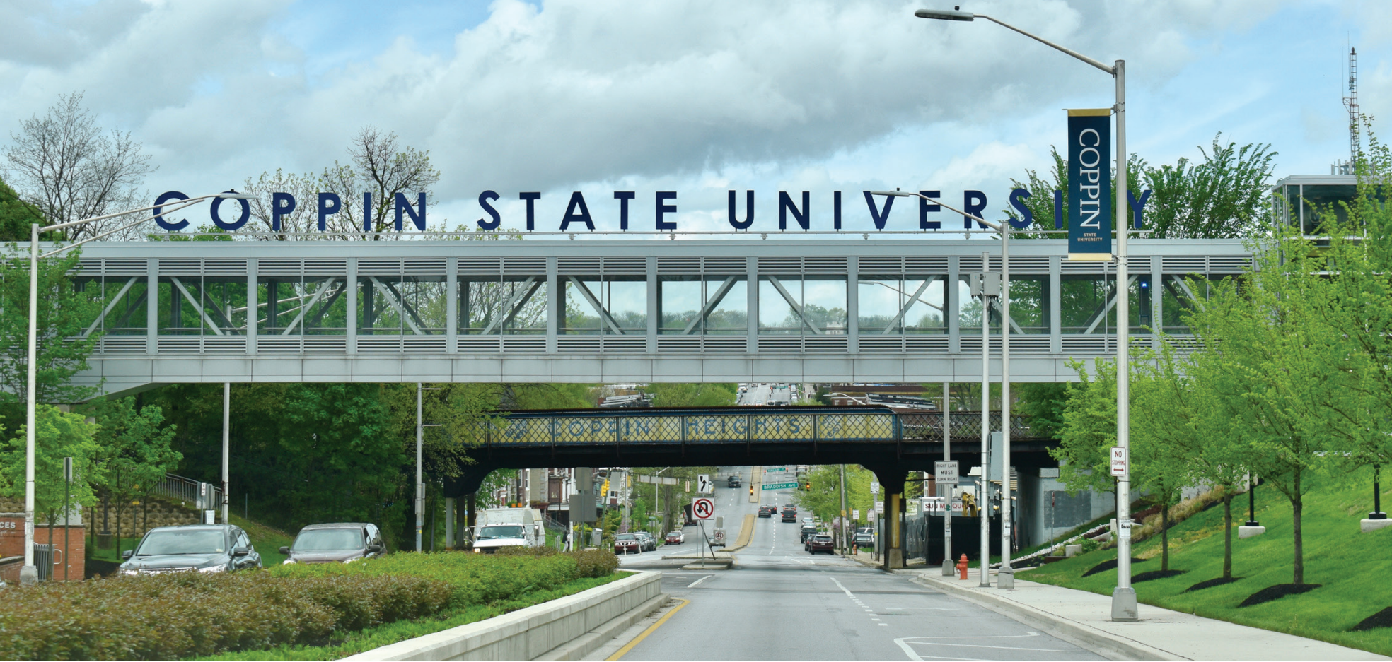
The bridge on west north ave that allows students to travel to the other side of campus.