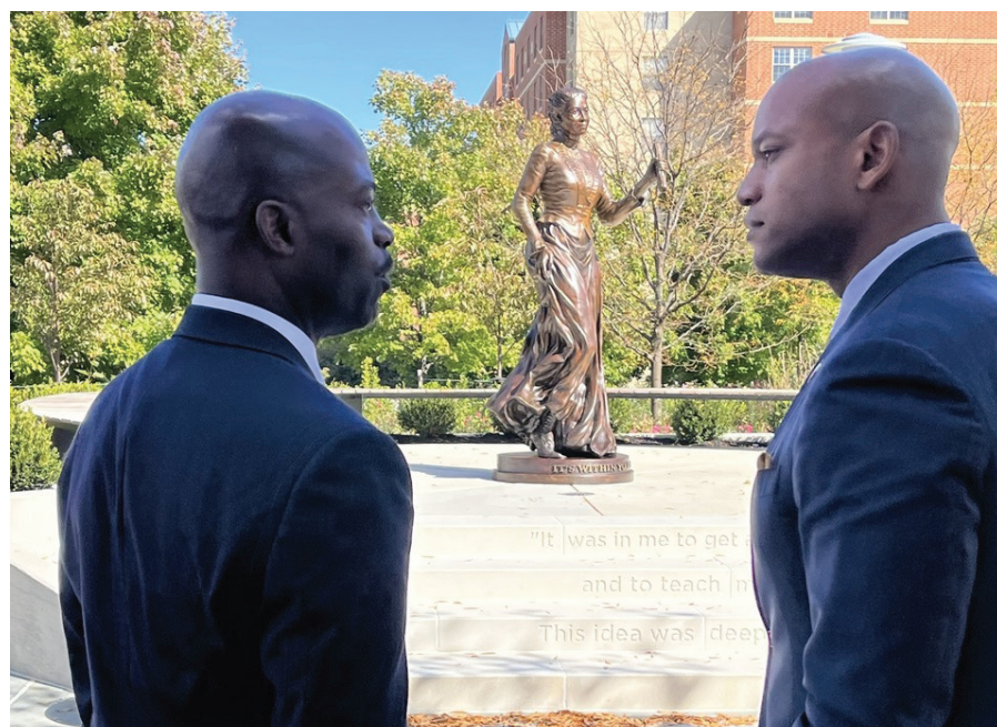
Above: Photos of Governor Wes Moore during his visit to Coppin State University.